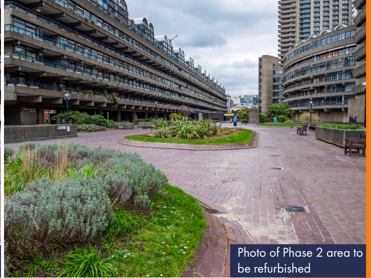
Photo of Phase 2 area to be refurbished