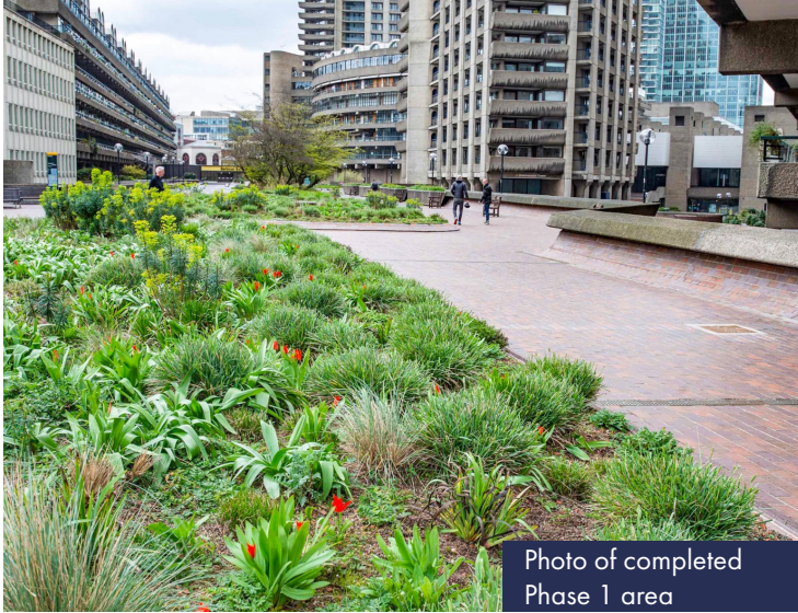
Photo of completed Phase 1 area